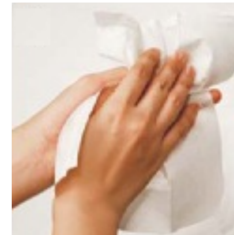
Rinse and wipe dry