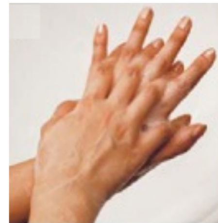
Back of hands